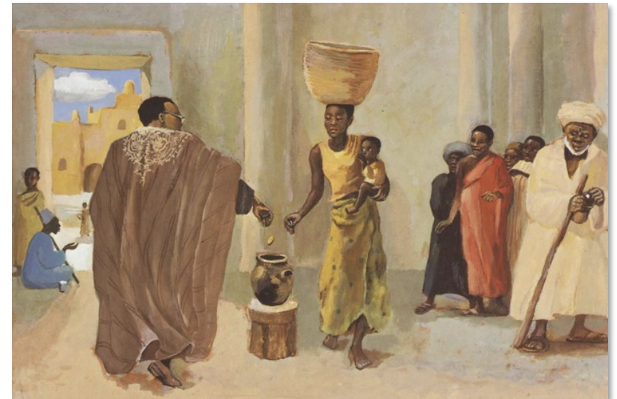
Revised Common Lectionary

A Christian presence in the community, living by faith, known by love, sharing a voice of hope.