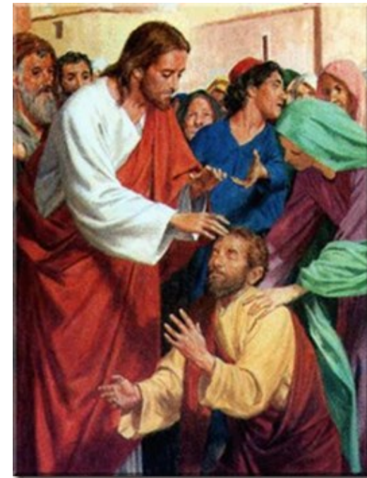
Daily Prayers and Meditation

A Christian presence in the community, living by faith, known by love, sharing a voice of hope.