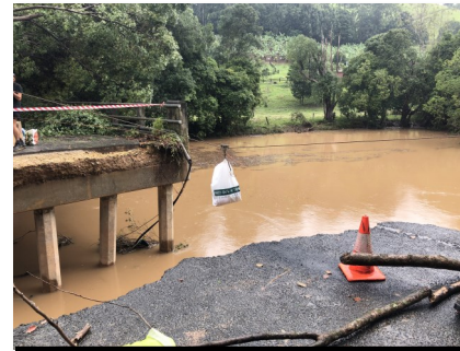
Grocery delivery to stranded Main Arm residents