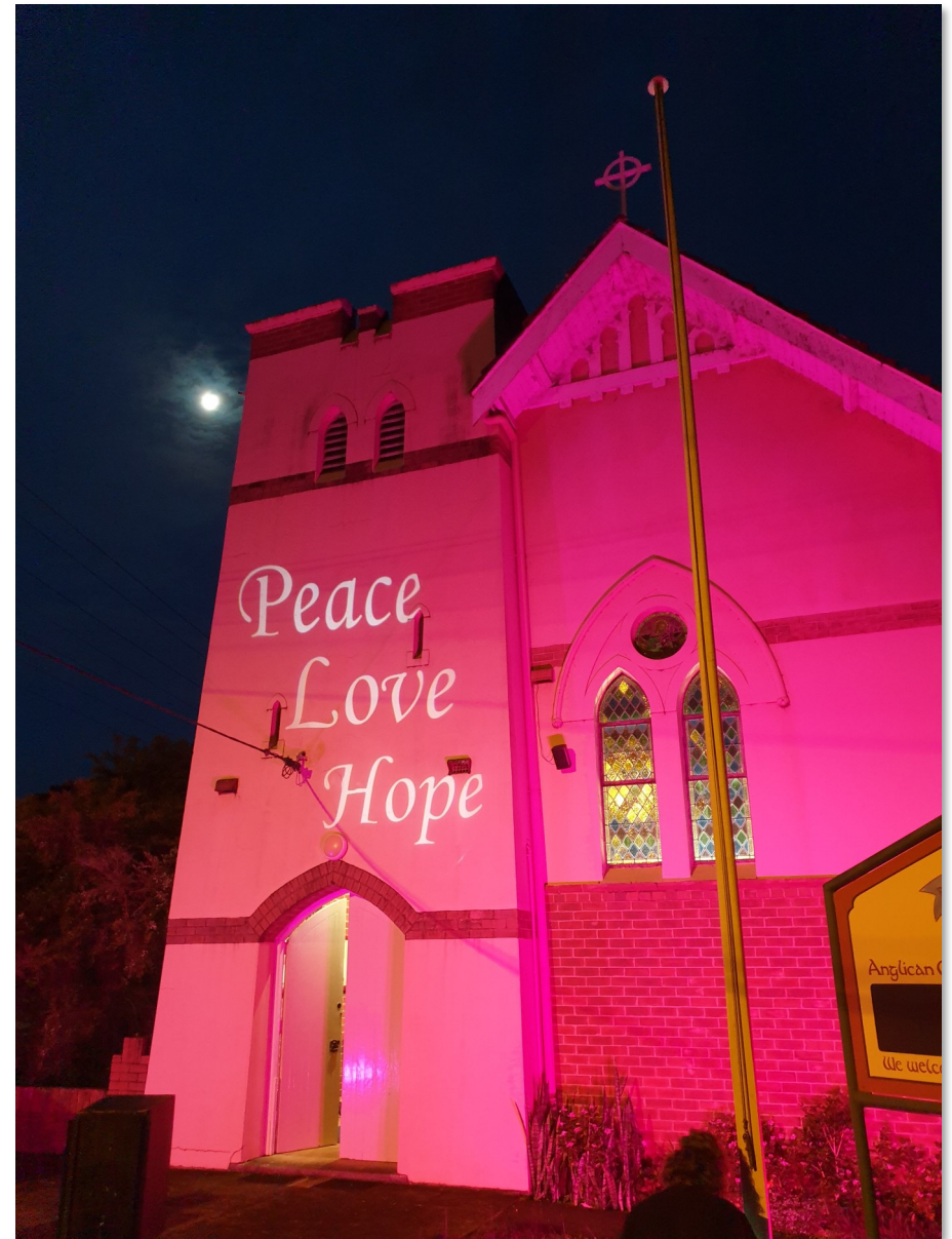
All Soul's Bangalow Christmas Lights